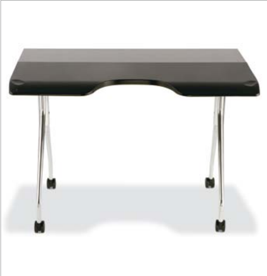
Envelop desk with polished aluminum legs