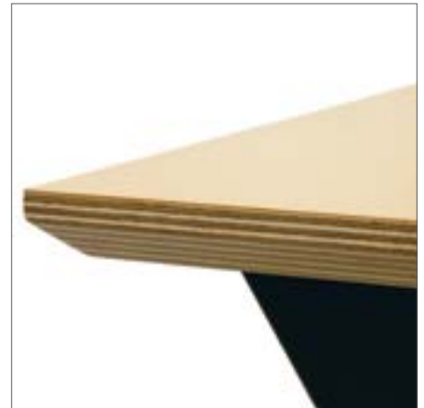
Veneer top with stained plywood edges