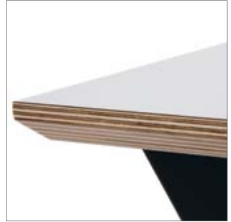
Laminate top with clear plywood edges