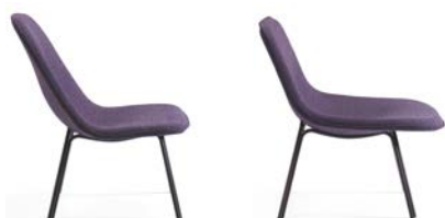
PAL HIGH & LOW Easy Chair By Claesson Koivisto Rune