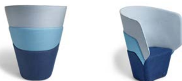
LAYER Easy Chair By Läufer + Keichel