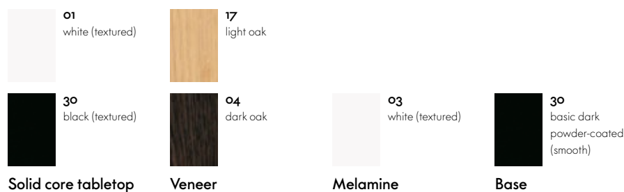
Solid core tabletop