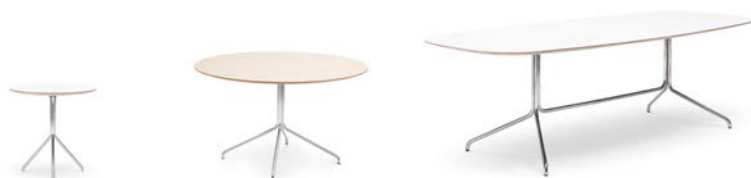
BOND Table By Jean-Marie Massaud