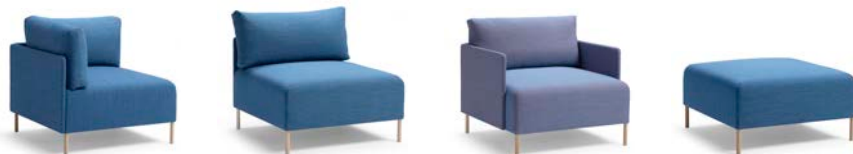
BLOCKS SOFA SYSTEM Corner, 1-seater, Easy Chair & Ottoman By Christophe Pillet