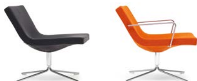
BOND Easy Chair & Easy Armchair By Jean-Marie Massaud